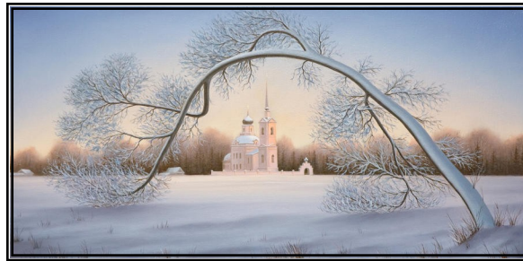
First Christian Church of Effingham

First Christian church 901 N. Henrietta Effingham, IL 62401 SERVICE REQUESTED