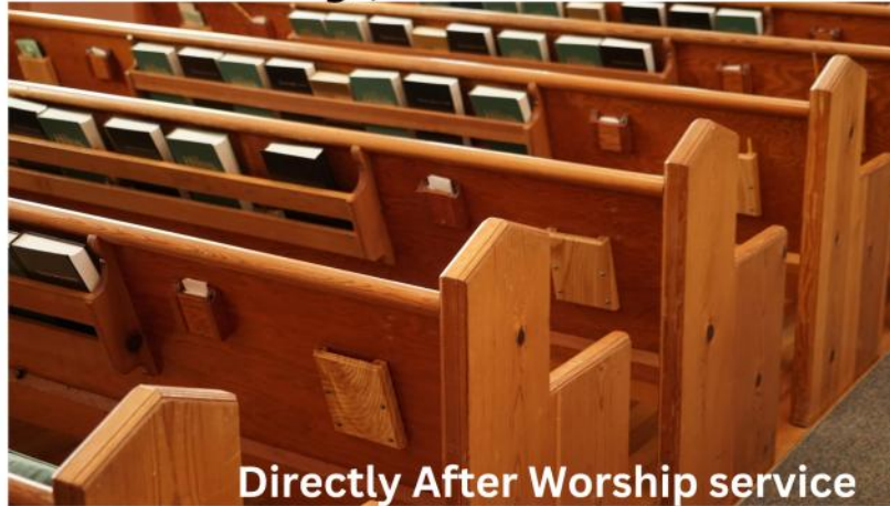
Directly After Worship service

SUMMER CAMP 2023 REGISTRATION OPENS MARCH 6 AT 10AM!