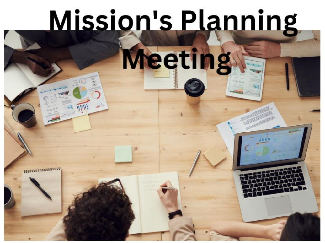
Meets Tuesday, June 27th @ 6:00 p.m.